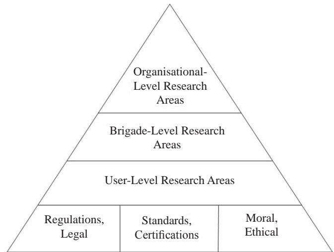
Figure 3. Hierarchical operational considerations.

Concept of Operations: A concept of operations (CONOPS) is a document describing the characteristics of a proposed system from the viewpoint of an organisation using the system 15 . CONOPS documents are developed by agencies or military forces. Developing an integrated CONOPS satisfying all stakeholders is a challenging task. But developing a CONOPS for UAVs is crucial in addressing all stakeholders needs for a coordinated deployment of UAVs. The first CONOPS 16 on UAVs was published in 1996 by U.S Air Combat Command. The next CONOPS focuses on High-