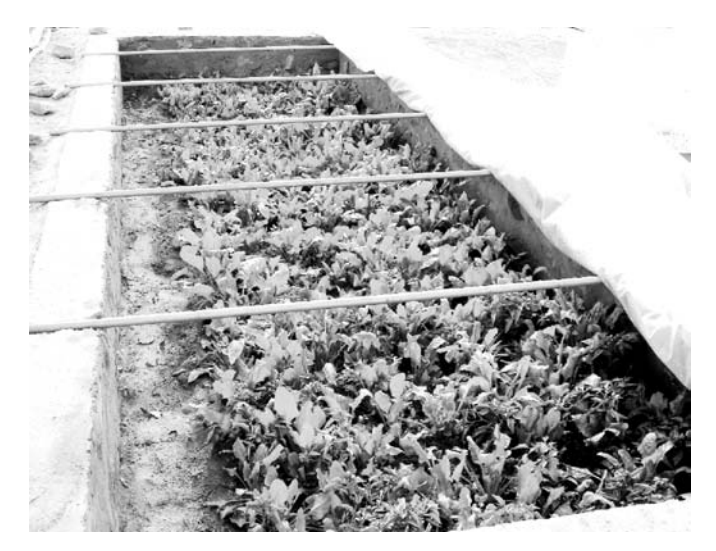
Figure 2. Spinach cultivation in the trench during severe winter.

bore. This polyhouse will have a single-layer covering of UV-stabilised polythene of 800 gauge. The exhaust fans are used for ventilation. These are thermostatically-controlled. Cooling pad is used for humidifying the air entering the polyhouse. The polyhouse frame and glazing material have a life span of about 20 year and 2 year, respectively.