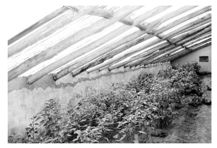
Figure 4. Capsicum cultivation in double-walled polyench (inside view)

impossible to grow the vegetables during this period under open conditions. So, growing of vegetable crops in a low-cost greenhouse during this period is very profitable. Control of disease and pest in greenhouse is also easy.