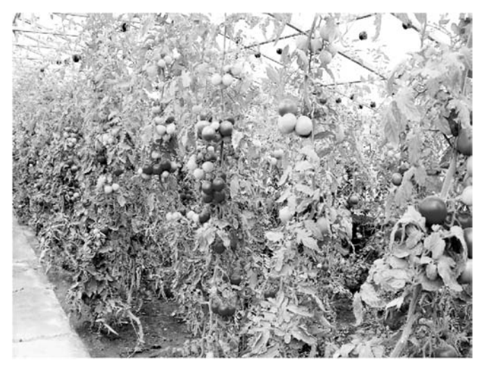
Figure 5. Tomato crop in the FRP greenhouse.

per cent cropping intensity with nursery raising under triple-layered greenhouse (Figure 5).