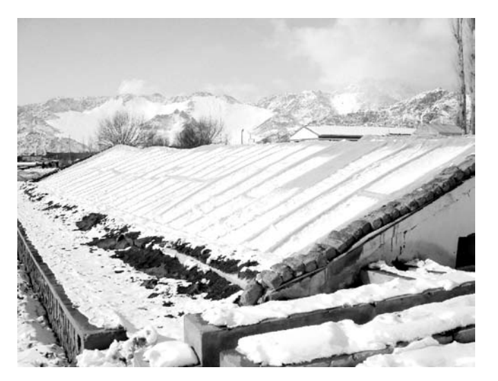
Figure 3. Double walled polyench (outside view).

The low- and medium-cost greenhouses have wide scope in production of domestic as well as exportoriented vegetables. Ladakh region recorded temperature upto -40 °C during sever-winters due to which it is