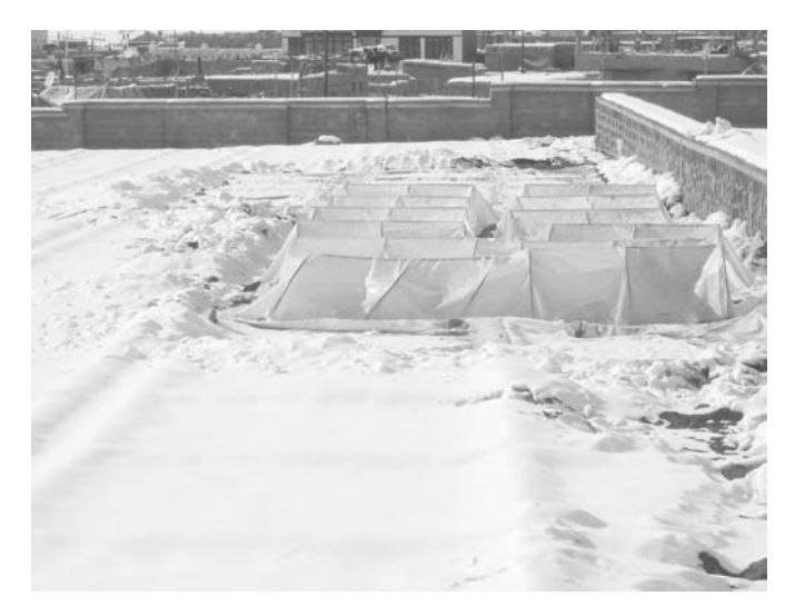
Figure 6. Poly-tunnel greenhouse for garlic cultivation during extreme winter.

During winters in Ladakh region, the temperature and solar radiations are sub-optimal for growing any vegetables. Hence during extreme conditions of winter season (October– February), leafy vegetables like Swiss chard, Spinach, coriander,