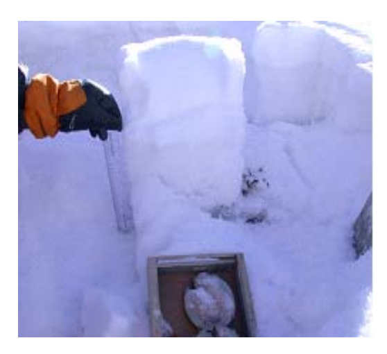
Figure 6. A column failed after few steps of loading.