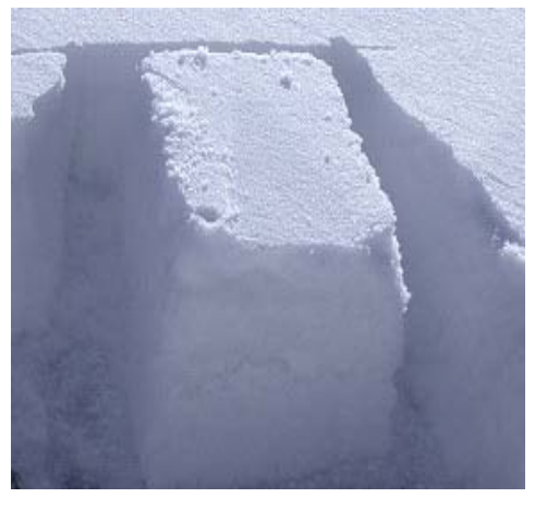
Figure 4. Snow column of upper dimension 18 cm x 13 cm.