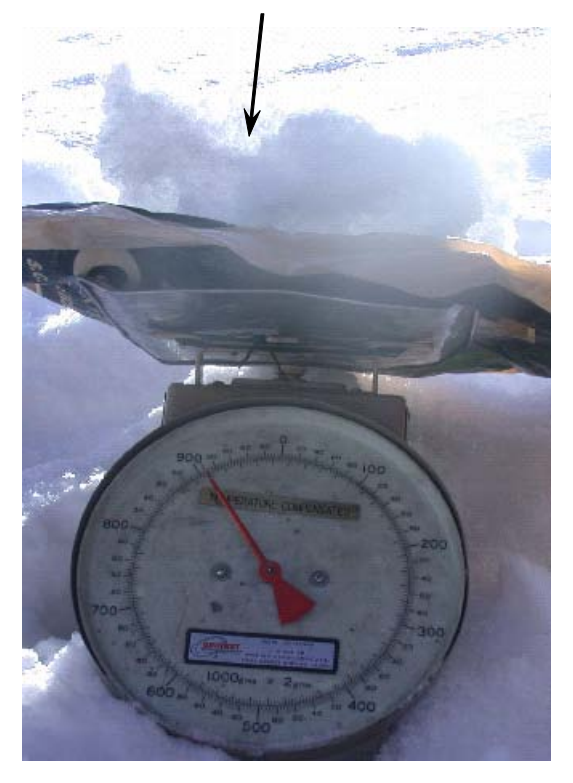
Figure 1. A snow block over the weighing machine for loading the snow columns but snow grains disintegrated in large amount during the preparation and weighing of snow block.

the test on six columns (Fig. 2 shows one of those 6 snow columns which were prepared for loaded-column test). A new stability test known as QSLBT was then introduced to overcome difficulties encountered in loaded-column test.