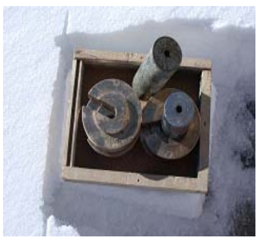
Figure 5. Loaded-column after some steps.