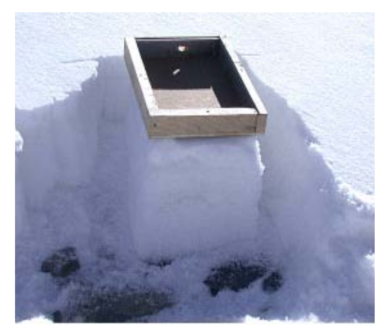
Figure 3. Wooden block placed over the snow column.