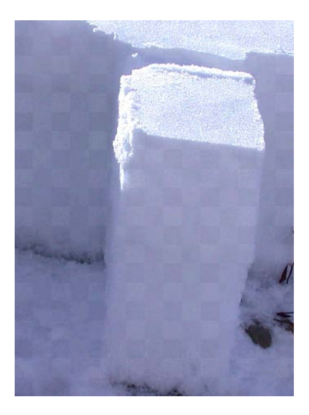
Figure 2. Prepared snow column for loaded-column test on a mountain slope.

Then the column was loaded by the iron weight in steps (Fig. 5) until failure of the column occured (Fig. 6). In the present case, 1 kg iron weight were used for step-loading of the column. The steploading weight can be varied from 0.25 kg to 5 kg, depending on the snowpack condition and observers