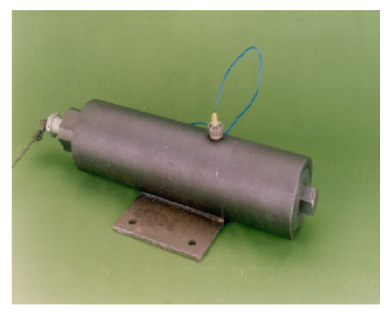
Figure 1. Photograph of atypical closed vessel.

An extension of closed vessel method to determine the burn rate of propellants in the intermediate pressure region 9.8 MPa to 75 MPa was introduced in 1975<sup>4</sup>. The method consists of burning of a known charge weight and web size of the test propellant along with a known charge weight of standard propellant whose burning rate is very fast compared to the test propellant. Subsequently, the equations are given in succeeding paras to estimate percentage heat lost.