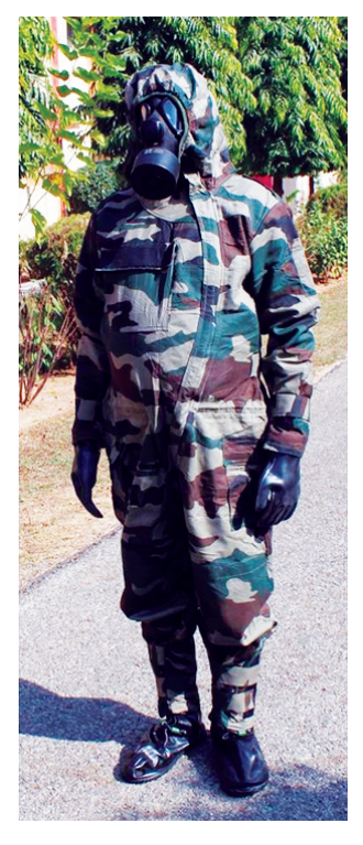
Figure 2. Chemical protective suit.