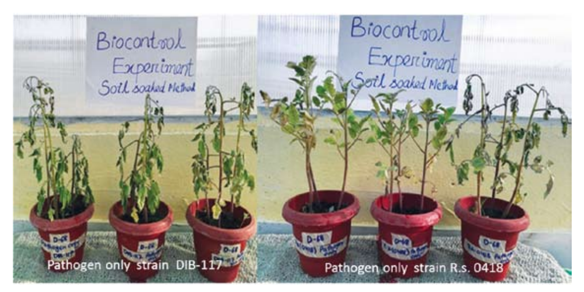
Figure 5. Pathogen only control in soil soak method and appearance of wilting.

associated with resistance. In most cases, multiple compounds generated by one B. subtilis strain are involved in the restraint of pathogens<sup>38</sup>. In general, vulnerability of the rhizosphere for invasion by soil pathogens is inversely associated to the diversity of the rhizosphere microbiome whereby amplified diversity can result in reduced pathogen virulence<sup>39</sup>. From our study, we are of the view that, the strains; DIB76/ BCS-9, DIB76/BCS-10, DIB76/BCS-21, DIB76/BCS-24 and DIB76/BCS-27 produce certain antibacterial (may be antibiotics or enzymes) substances as evidenced in in-vitro studies. Hence these strains were successful in abolishing the pathogens thereby preventing pathogen invasion and the disease.