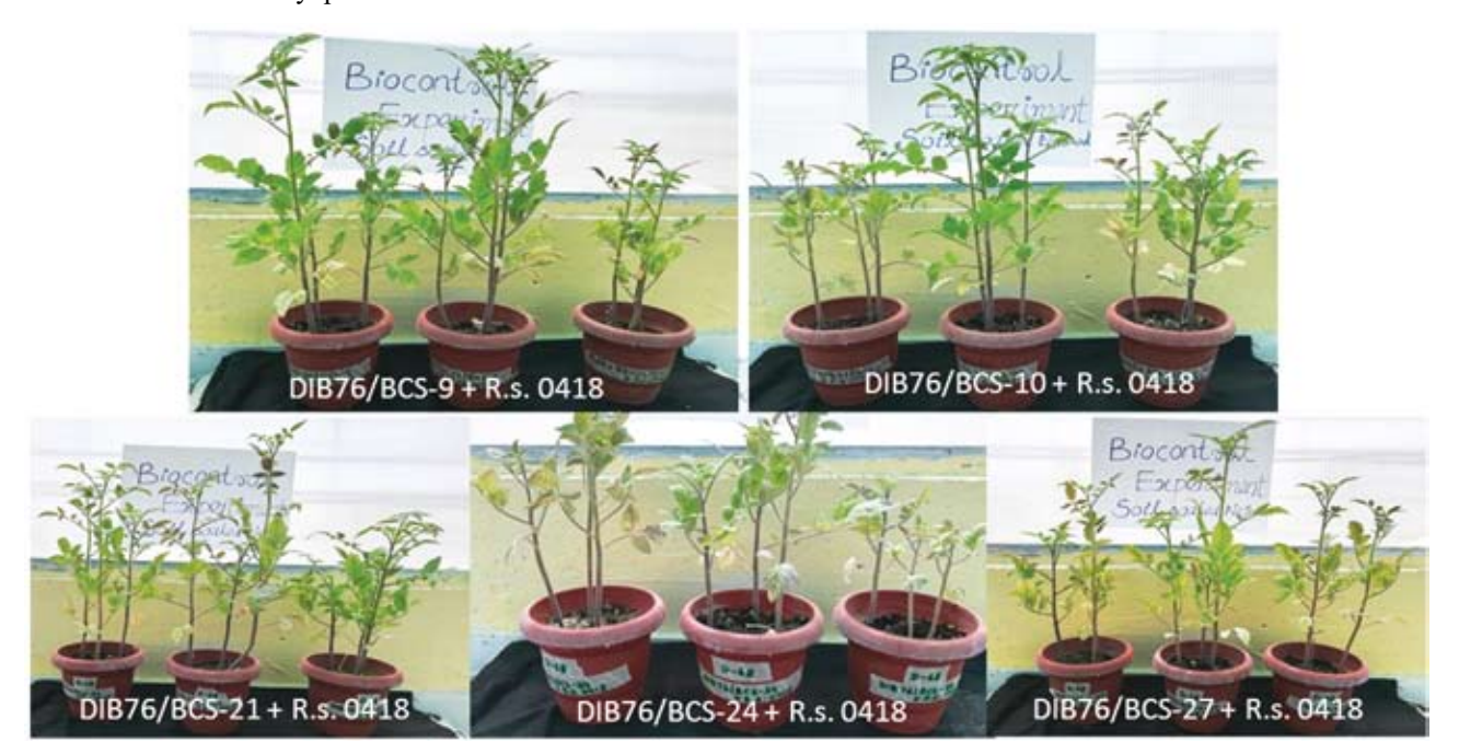
Figure 3. Tomato plants treated with biocontrol strains along with pathogen strain R.s.00418 via soil soaked method.