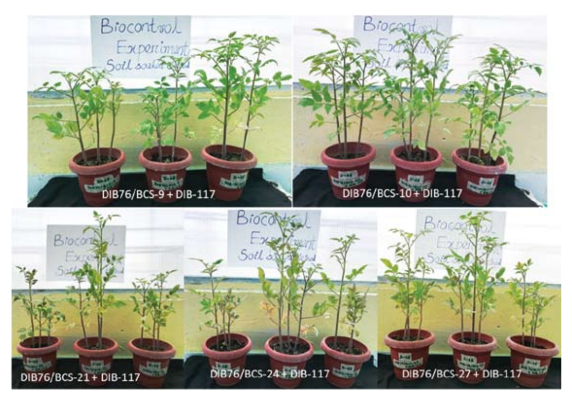
Figure 4. Tomato plants treated with biocontrol strains along with pathogen strain DIB-117 via soil soaked method.