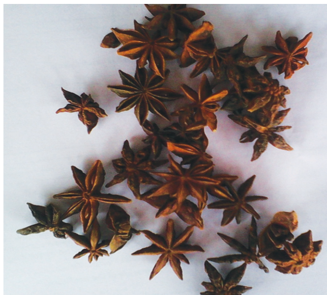
Figure 1. Illicium verum fruits.

Illicium verum Hook.f. is an aromatic evergreen tree widely distributed in southern China alongwith Vietnam and India. It is commonly known as Chinese star anise and Badyan, belongs to Illiciaceae family 11-12 . It consists of purple-red flowers, star-shaped anise-scented fruits as shown in Fig. 1 1 . It acquires the GRAS regulatory status (GRAS 21 CFR 182.10 CFR- Title 21).