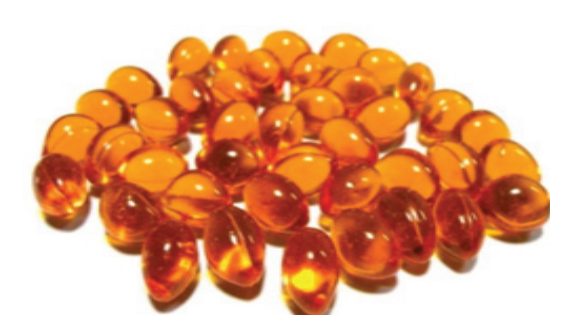
Figure 3. Seabuckthorn oil soft gel capsule.

Seabuckthorn oil soft-gel capsule is a formulation from supercritically extracted Seabuckthorn ( Hippophaerhamnoides ) seed oil, which is optimally enriched with bioactive compounds viz . Vit 'E', \beta -Carotene; along with essential (omega-3 & omega-6) and non-essential (omega-7 & omega-9) and others fatty acids; saturated and unsaturated [monounsaturated (MUFA) & polyunsaturated (PUFA)] fatty acids and minerals viz. calcium, phosphorous, iron, zinc, magnesium, selenium etc. that are a natural source of antioxidants (Fig. 3).