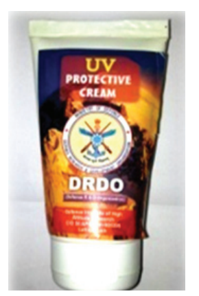
Figure 6. UV protective cream.

UV protective cream with anti-photoageing and antiblemishes properties is an herbal formulation that contains Seabuckthorn seed oil as a major ingredient. The formulation also contains uvinul t 150-ethyl hexyl triazone, uvinul mc 80-ethylhexyl methoxy cinnamate, tinisorb m-methylene bisbenzotriazolyl tetra methyl butyl phenol, uvinul a-diethyl amino hydroxyl benzoyl tetra methyl butyl phenol, tinosorbbis-ethyl hexyloxyphenol methoxy phenyltriazine, petroleum jelly, isopropyl myristicate (IPM), light liquid paraffin (LLP), bees wax, emulsifying wax (E Wax), cetyl alcohol, glycerol monostrearate (GMS), stearic acid, Mucopolysaccharide polysulphate (MPS), Butylated hydroxytoluene (BHT), fragrance, and distilled water. The formulation does not contain zinc and has UV protective efficacy equivalent to SPF > 45along with anti-blemishes and skin healing properties. The formulation can be used as a prophylactic for low humidity and UV mediated skin damage at high altitude (Fig. 6).