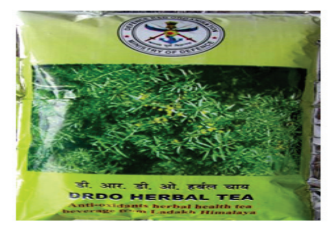
Figure 2. Seabuckthorn herbal tea.