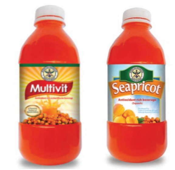
Figure 1. Seabuckthorn beverage and Seapricot beverage.

Seabuckthorn based herbal tea, having anti-oxidant and anti-stress properties, is formulated from indigenous high altitude medicinal plants of Ladakh Himalaya. Seabuckthorn ( Hippophae rhamnoides ), Salam panja ( Dactylorhiza hatageria ), Local tea ( Bidens pilosa ), Local caraway ( Carum carvi ), Origano ( Origanum vulgare ), Local mint ( Mentha longifolia ), Yarrow ( Achillea sp. ) etc. are the major ingredients of herbal tea formulation. These herbs are commonly used in Amchi system of medicine (Tibetan system of medicine) for various ailments such as stress, indigestion, gastritis, headache, cold, cough, fever, high blood pressure, body pain, high mountain sickness, memory lost, and weakness etc. since ages (Fig. 2).