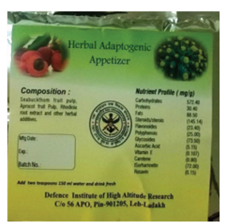
Figure 5. Herbal adaptogenic appetiser.

It is a composite herbal nutraceutical comprising of Seabuckthorn ( Hippophae rhamnoides ) pulp, apricot ( Prunus armeniaca ) pulp and rhodiola ( Rhodiola imbricata ) root, mixed at standardised optimal ratio of 100:50:1, respectively, and innovating with other additives (Mint mix) to improve the aesthetic appeal, the additives being - Mint powder, Cumin powder, Coriander powder, dried Mango powder, Stevia extract and Himalyan black salt (Fig. 5).