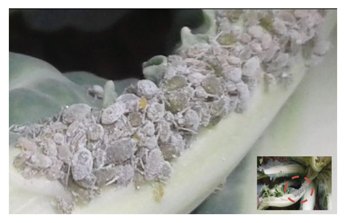
Figure 1. Brevicoryne brassicae (cabbage aphid) as shown on the leaf of B. oleracea var. botrytis (insat), and after 100X magnification (main plate) in Ladakh (J&K), India.

Microscopic examination revealed that the aphid collected from all the three crops were Brevicoryne brassicae. B. brassicae, popularly known as cabbage aphid are most common aphid species that cause problems in protected vegetable cultivation (Fig. 1). The representative photographs of the aphids affected crops taken in the present study presented in Fig. 2 (a) - 2(c) show that there has been significant decrement in the quality of the crops. The quantity loss (%) in the crops has been shown in Table 1. In B. oleracea var. botrytis, there was shrinking in the leaves and leaf thickness was found to reduce by 56.3 %, while the root diameter was reduced by 37.7 % as compared to the control plant. There was 17.4 % decrease in overall chlorophyll contents in the affected plants whereas the total yield after harvest was reduced by 41.9 % (Fig. 2(a)). In B. caulorapa, the leaf area was found to reduce by 54.8 %, while leaf thickness and leaf length recorded a net loss of 27.3 % and 42.3 % as compared to the normal crop respectively. Although the net chlorophyll content was reduced by 7.5 %, but 35.4 % loss was recorded in the net yield (Fig. 2(b)). R. sativus crop showed 31.5 % loss in leaf area whereas root length was found to reduce by 23.9 % compared to the control.