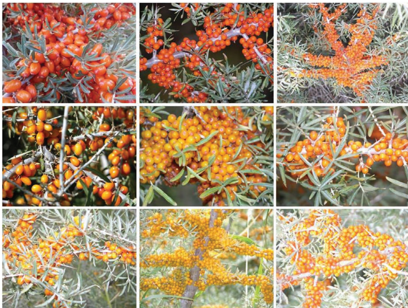
Figure 1. Morphological diversity of H. rhamnoides in Ladakh.

Diploid chromosome number of H. rhamnoides is 2n=24 . The chromosome length ranges between 57.7 and 65.2 \mu\text{m} 10 .