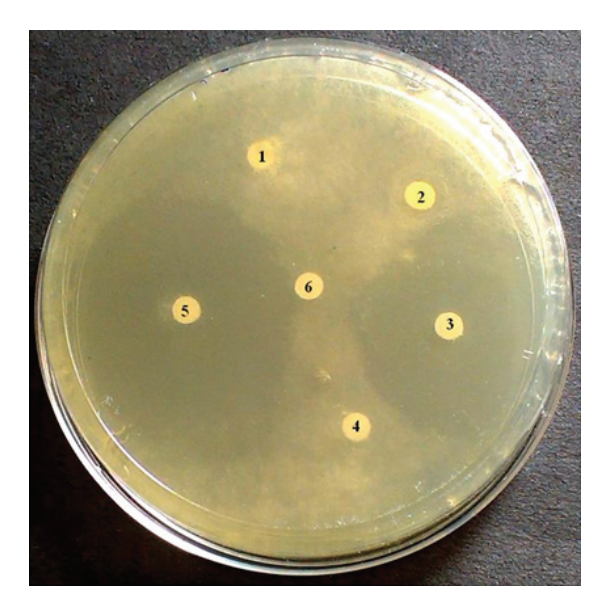
Figure 1. In vitro antifungal activity of Camelina sativa cv. Calena (EC643910) seed extracts [propanolic (disc 1), ethanolic (disc 2), methanolic (disc 3) and sterile deionised water (disc 4)] against Rhizopus stolonifer. Standard antifungal drug (Clotrimazole; 100 µg/ml) was applied on disc 5 as positive control. The DMSO solvent was also applied on disc 6 as negative control.

Major highlights of the results: Among all Camelina seed extracts tested, methanolic seed extract (Disc 3) showed significant antifungal activity against Rhizopus stolonifer .