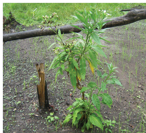
Figure 5. Plant of N. plumbaginifolia .

Cucumis sativus L. : It is used in cases of endoparasitic leech infestation. Either tender leaves or the whole fruit is