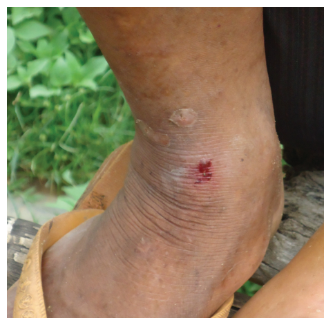
Figure 2. Wound caused by leech bite.

and application of biomedicines. The most common complication of leech infestation is non-coagulation of blood (Fig. 2) and proper management of the wound is key to prevention of secondary infections. A total of thirteen anti-leech plants have been recorded among different ethnic groups of Assam (Table 1) while as many as eight non-plant products are also used for management of leeches (Table 2). Besides, wood ash and charcoal of almost all plants are used as source of remedy for management of leech infestation. Study on anti-leech medicinal plants has received comparatively less attention from researchers and therefore there is a need to enhance ethnobotanical studies among unexplored cultures before it is too late.