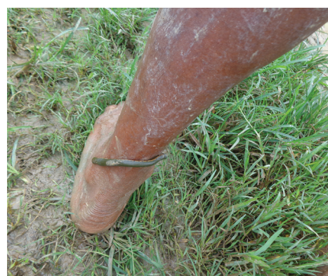
Figure 3. Aquatic leech ( Hirudinia sp.)

Thirteen anti-leech plants have been recorded and grouped into three use categories namely repellent, killing agent and management of wounds. Nine plants are used to repel leeches, three species are used to kill leeches and five plants are used in management of wounds and secondary infections (Table 1). Two plants are reported to be effective (repellent and killing agent) against aquatic leeches, three species are effective (repellent and killing agent) against terrestrial leeches while eight are effective against both aquatic (Fig. 3) and terrestrial leeches (Fig. 4). Traditional uses of plant ethnomedicines against leeches is briefly