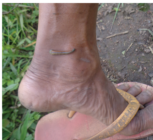
Figure 4. Terrestrial leech ( Haemadipsa sp.)