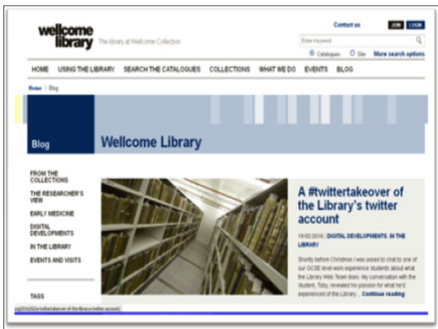
Figure 1. Screenshot of Wellcome Library.

Figures 1-5 are some of the screen shots of library blogs, and other LIS-related blogs for reference 6,7 .