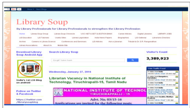
Figure 3. Screenshot of Library Soup.