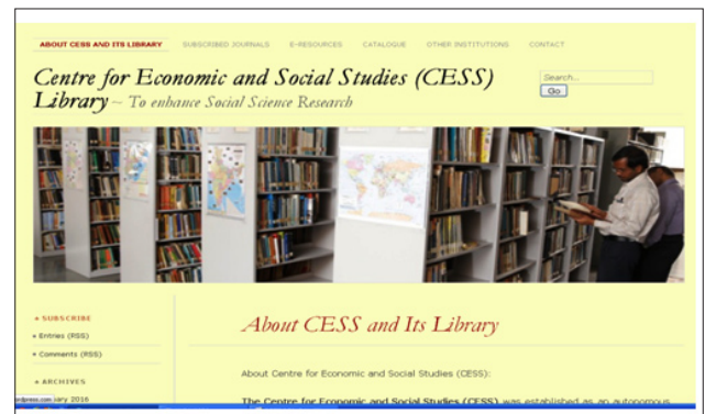
Figure 4. Screenshot of Centre for Economic and Social Studies (CESS) Library.