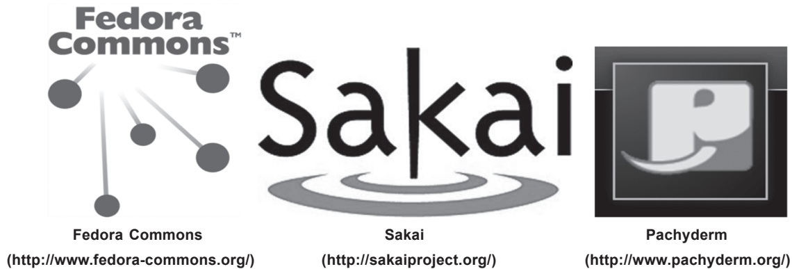
Figure 4. Logos of the three open source tools (used in the VET development project).

A small group at the University of Virginia worked for two years on an open source tool that leverages three other open source tools: Fedora, Sakai, and Pachyderm. This new tool, the VET was designed to make it easy for faculty to do more sophisticated presentations in either web pages or slide show formats (Fig. 4).