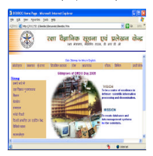
Figure 9. DESIDOC site on DRONA