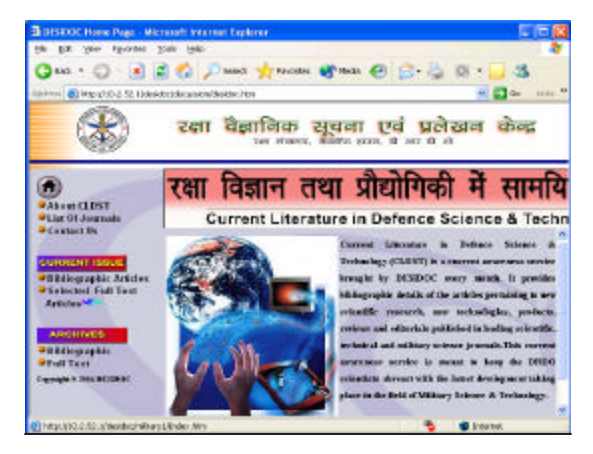
Figure 2. CLDST service

service published by DESIDOC every month. It provides bibliographic details of the articles pertaining to scientific research. technologies, reviews, and editorials published in the leading scientific and military science journals. This current awareness service is meant to keep the DRDO scientists abreast with the latest development taking place in the field of military science & technology. It covers a total of 112 journals, out of which 49 journals are military science journals and 63 journals are science & technology journals. CLDST is available both in print and electronic version. Electronic version is available online since January 2001. The retrieval and accessibility of information from this service has been further enhanced by creation of a 'specialized subject index'. 1,719 articles were added to the database during the period, and 68 articles selected from these, were digitized and full-text of the same was uploaded to DRONA. Full-text of references selected from CLDST can be obtained from DESIDOC on request through e-mail/post.