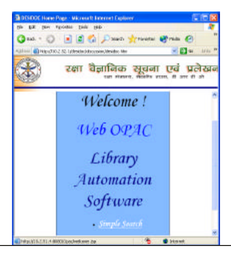
Figure 3. OPAC

facilitate current and retrospective search of the journal articles available in DSL. All the articles pertaining to defence technologies, policies, weapons, and R&D activities published in the journals received in DSL from 2000 onwards are incorporated in the databases. It covers a total of 112 journals, out of which 49 journals are covered by military science and 63 journals covered by science and technology. The database is developed using software WINISIS and is searchable on title, author, name of the journal, etc. The databases is updated regularly. A total of 1719 records were added during 2005.