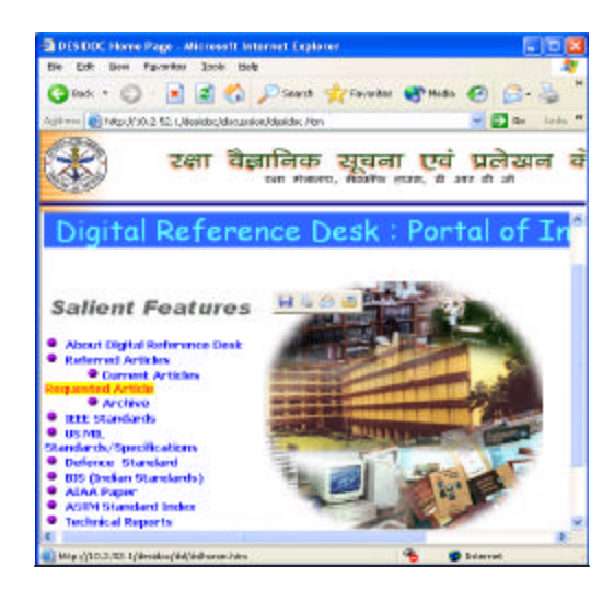
Figure 1. Reference Desk

service also includes bibliographies on important subjects as well as on new reference sources procured by the DSL. This service is available on DRONA.