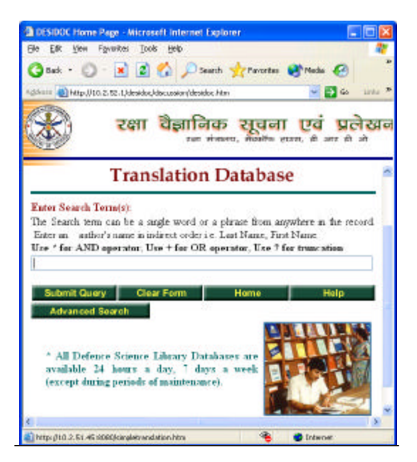
Figure 4. Translation database