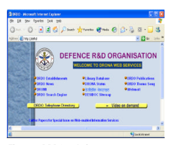
Figure 8. DRDO website