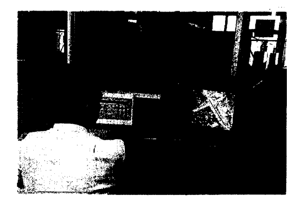
Software processing of a digital image

(i) The representation and stability of the vendor company is essential for the