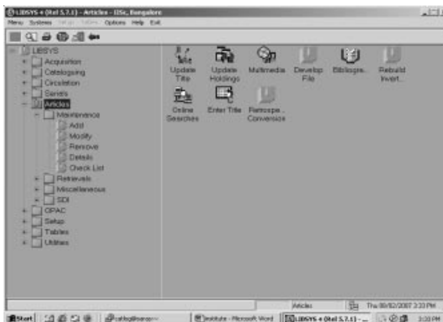
Figure 1. Screen shot of LibSys article indexing page of IISc.