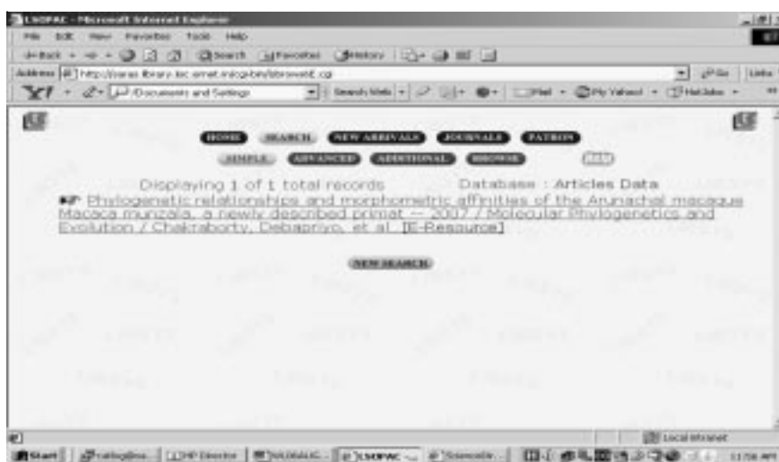
Figure 3. Screen shot of web OPAC.