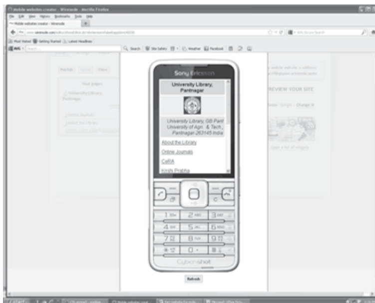
Figure 2. Preview of the mobile website.