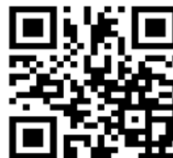
Figure 4. QR code of the website.

The QR code is two dimensional barcodes. It was first designed in Japan for automobile industry 15 . Now the QR code is very common in mobile phone web industry. The website's address is easily transformed into QR code by various software. These QR codes are quickly read by mobile phone devices. The QR codes are very helpful rather than typing web address on small phone devices. These are more useful than barcode because they can store much more data. Following QR code at Fig. 4 of this model website is created with the help of Wirenode.