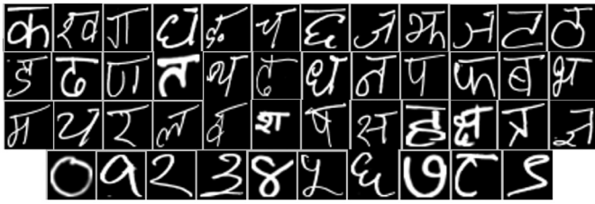
Figure 2. Samples from 46 classes of Devanagari dataset 18 .