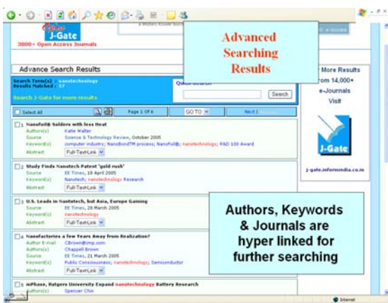
Figure 1. Screen shots of quick search and advanced search browse by journal.