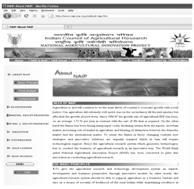
Figure 1. NAIP website.

The NAIP<sup>5</sup> is world's second biggest World Bankassisted agricultural project being executed by NARS with a life-span of six years. Started from 24 July 2006 to 2012. The objective of the NAIP is to facilitate an accelerated and sustainable transformation of the Indian agriculture, so that it can support poverty alleviation and income generation through collaborative development and application of agricultural innovations by the public organisations in partnership with farmers, private sector, and other stakeholders.