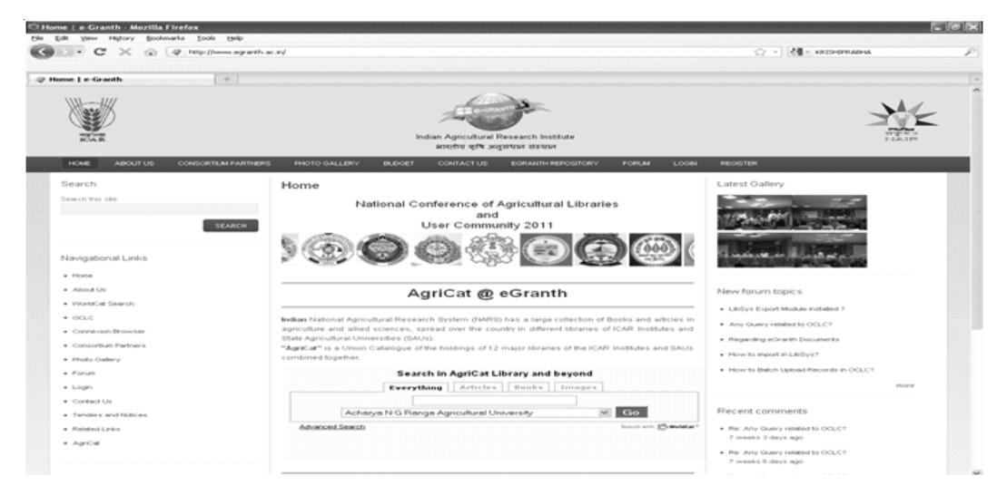
Figure 4. e-Granth website.