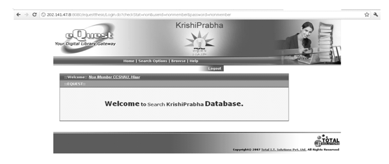
Figure 2. KrishiPrabha website.

There are about 47 agricultural universities and 4 deemed agricultural universities in India which award doctoral degrees in agriculture and allied disciplines.