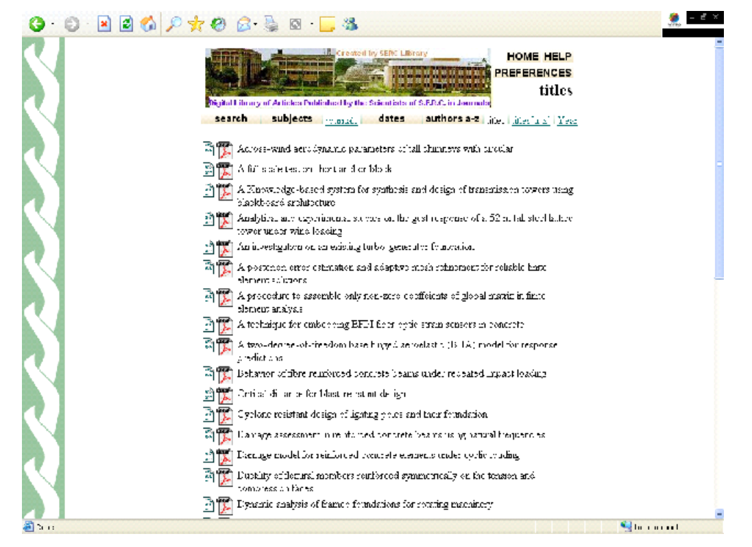
Figure 6. Instititional repository.