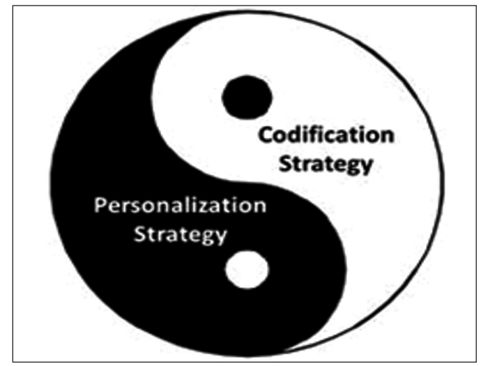
Figure 1. An integrated KM strategy model.

In support of these opinions, many studies have been conducted by scholars such as Haesli & Boxall<sup>8</sup>, who conducted a study of two high technology manufacturing companies, the result of the study shows that both companies followed one strategy in a predominant way. Though, Jasimuddinet<sup>9</sup>, et al. , argued that in order to gain key benefits, both codification and personalisation need to be integrated. The combination of both strategies led to a great need for companies to improve the way in which they manage their knowledge. Choe<sup>10</sup> enlightened that a KM strategy as integrated approach, i.e., it's a combination of both codification and personalisation strategy. In this integrated approach, the balance of the exploitation and exploration are well achieved and